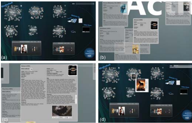
Figure 1. (a) Initial screen of MedioVis 2.0 (b) Zoomed into the action region (c) Most detailed semantic zoom level of a movie object (d) Query “batman begins” entered into the search field on the upper right.