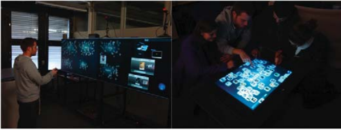
Figure 4. MedioVis 2.0 on different devices: (a) large high resolution display (3840x1080 pixel) (b) Microsoft Surface ( http://www.microsoft.com/SURFACE ) multitouch table.