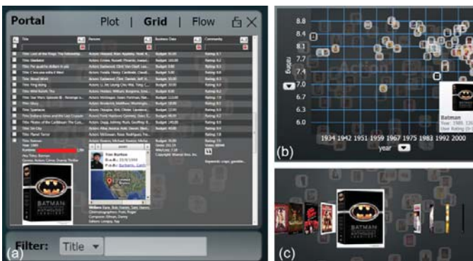
Figure 2. Portal containing all action movies. The user can choose between (a) the HyperGrid, (b) the HyperScatter and (c) a rapid serial visual presentation inspired by Apple’s Cover Flow ( http://www.apple.com/itunes/ ).

Analytical search methods are supported by MedioVis 2.0 as another way to formulate information needs. Users are able to enter text queries into a search field on the upper right corner of the screen (see fig. 1d). With each key press, the visual representation of matching objects expands. We applied the concept of Dynamic Queries and Sensitivity [10] for direct highlighting of objects, which still match the current query instead of removing all non matching objects. With this technique, the attention of the user is automatically directed towards media objects of current interest.