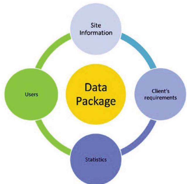
Figure 2. data package parts

Gathering and collecting the information is the first and main step in any process. The information package is a term we use for all project inputs as follows: site information, client requirements, users’ information and statistics.