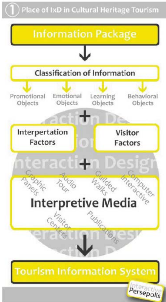
Figure 1. Role of IxD in cultural heritage tourism

“Tourism information system is a collection of knowledge and data about attractive destination.”[2] Based on this definition, TIS is involved with methods of receiving information about a specific place in official or non-official ways. TIS is a tool for transmitting information about a historical site to visitors. Our focus is on transmitting the information to visitors in such a way that they also participate in it interactively.